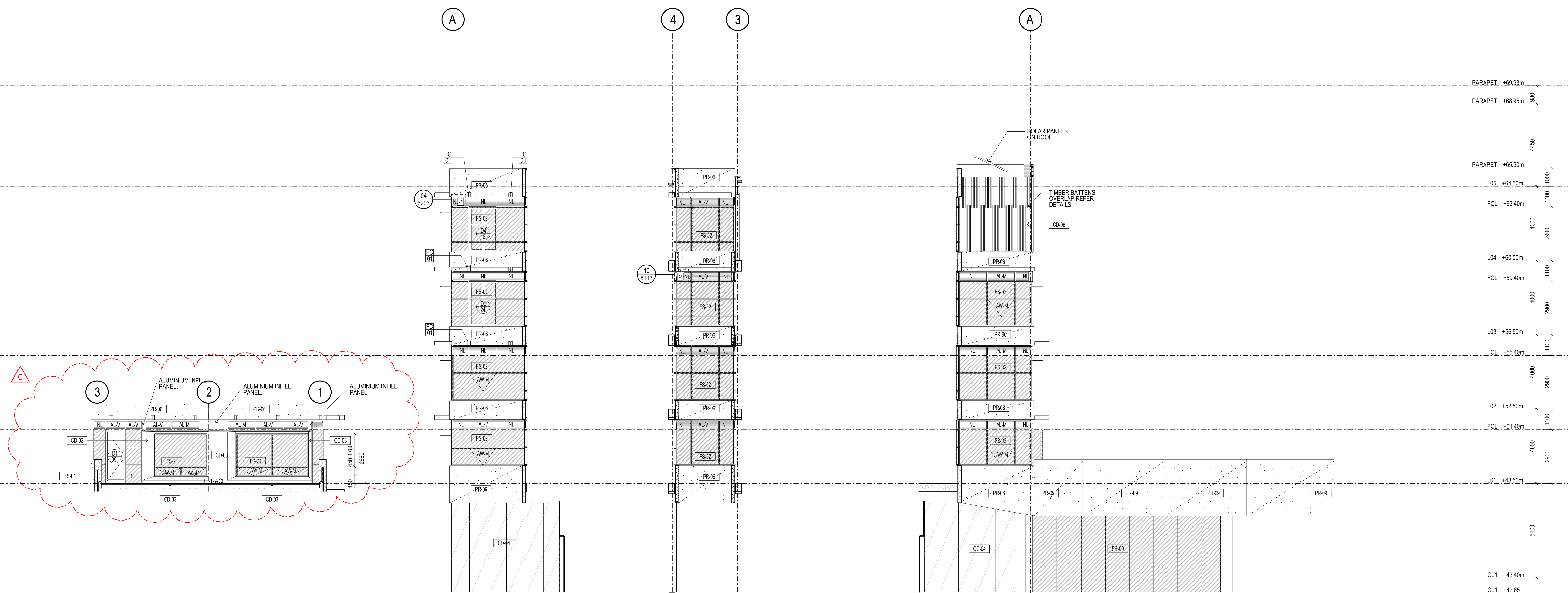
10 UNFOLDED NORTH ELEVATION SCALE 1:100